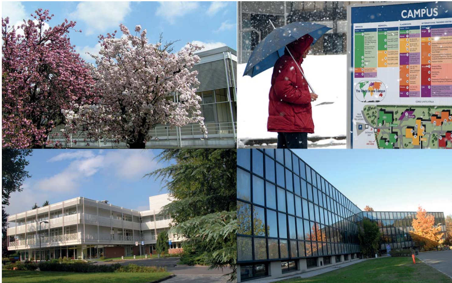
The ILO Turin Centre's facilities

Located in an attractive park on the banks of the River Po, the Centre's campus provides a congenial environment in which to live and study.